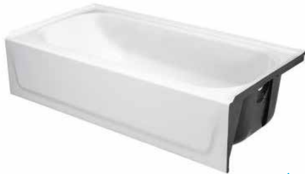
Your Current Tub

This simple conversion is saving people thousands of dollars in remodeling costs.