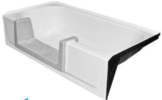
Your Current Tub Converted To A Roll-In Tub